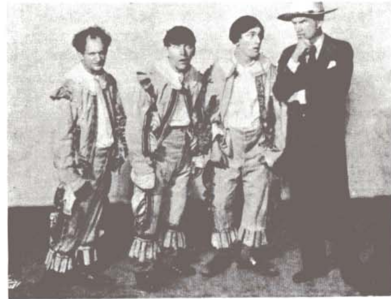
TED HEALY and his three Southern Gentlemen

The team of Ted Healy and his Stooges did well in vaudeville and appeared in several Broadway revues, such as the legendary "Earl