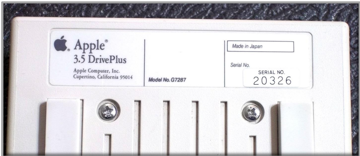
Figure 1. The Apple 3.5 DrivePlus, Model No. G7287.

Up until now it has been generally acknowledged that Apple's 1.44 Mb 3.5" drive was manufactured and marketed under two names, both bearing the G7287 model/family number – the Apple 3.5" FDHD drive and the Apple SuperDrive. But I have recently acquired another Apple 3.5" 1.44 Mb drive that is labelled with another name: the Apple 3.5 DrivePlus and also bears the model/family number G7287 (Figure 1).