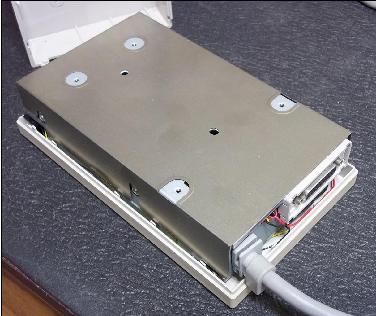
Figure 3. The additional metal housing found in the Apple 3.5 DrivePlus.