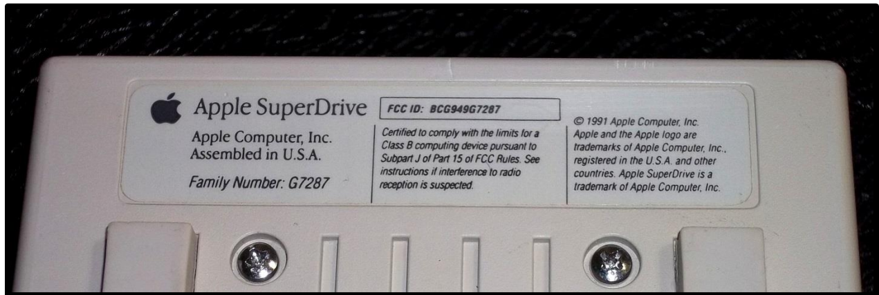
Figure 2. The Apple SuperDrive 3.5" 1.44 Mb floppy disk drive.

Compare the Apple 3.5 DrivePlus label with that of the Apple SuperDrive (Figure 2). Note that both have the model/family designation of G7287. Both drives appear to be identically internally, with the exception of the DrivePlus having an additional metal housing (Figure 3).