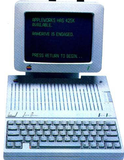
An Apple IIc with Z-RAM

The Apple IIc on the right works exactly the same as the Apple IIc on the left. Almost. The Apple on the right has a powerful memory expansion coprocessing card called Z-RAM. From Applied Engineering. Which means the Apple on the right can completely load AppleWorks into RAM—and then run it up to thirty times faster than the Apple on the left.